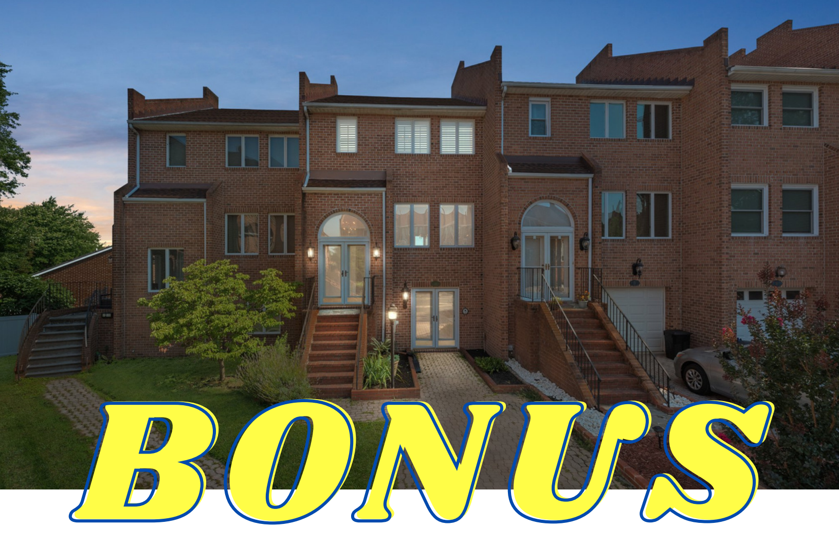
Here are 4 BONUS tips to help make it feel more like YOUR home: