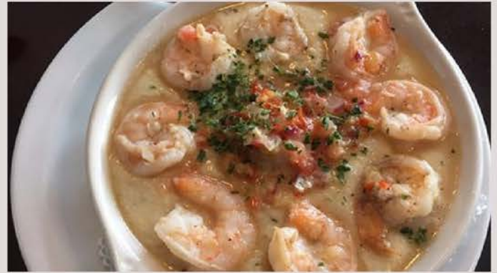
JULINGTON CREEK FISH CAMP

Biscottis is well known throughout Jacksonville for its decadent desserts. Their signature dish is bread pudding. This confectionary delight is served warm with vanilla ice cream, and it will melt your heart it's so good.