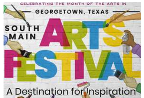
SOUTH MAIN ARTS FESTIVAL