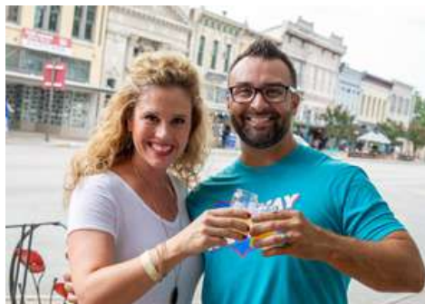
THE ANNUAL BLAZIN' BEER CRAWL