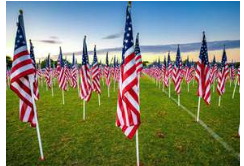
ANNUAL FIELD OF HONOR