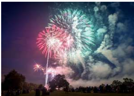
4TH OF JULY IN SAN GABRIEL PARK