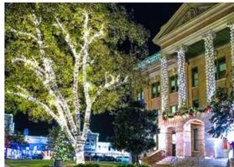
THE ANNUAL LIGHTING OF THE SQUARE | DOWNTOWN HOLIDAY LIGHTS

To explore further details, including specific dates, times, and locations for each event, please visit the following link: