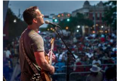
2024 RED POPPY FESTIVAL