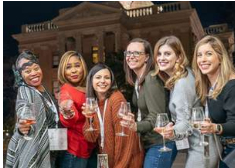
THE GEORGETOWN SWIRL