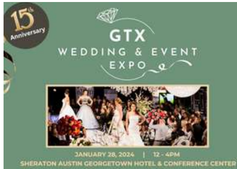
15TH GTX WEDDING & EVENT EXPO