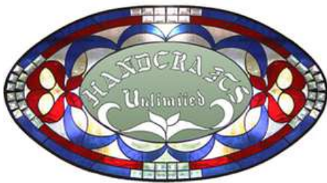
HANDCRAFTS UNLIMITED QUILT SHOW