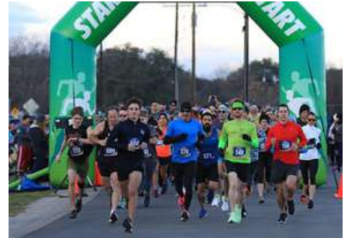
CUPID'S CHASE 5K & KIDS FUN RUN