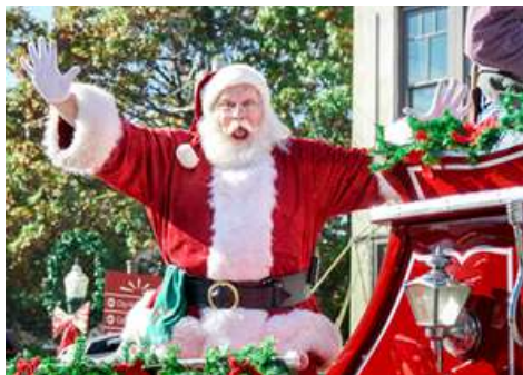
43RD ANNUAL CHRISTMAS STROLL