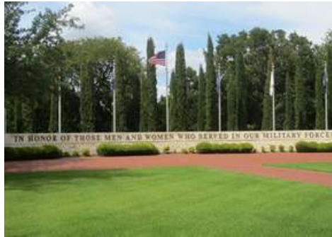
VETERANS DAY CEREMONY