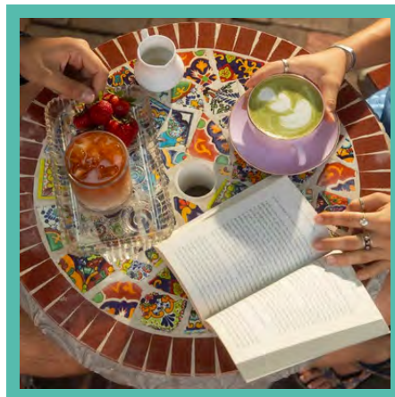
CUISINE & TO DO