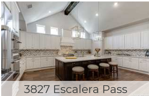
3827 Escalera Pass

Square Feet: 4,411 Bedrooms: 4 Baths: 4 1/2 Garage: 3 Car, attached Days on the Market: 51 Days