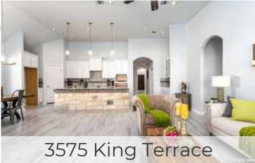
3575 King Terrace

Square Feet: 2,523 Bedrooms: 4 Baths: 3 Garage: 2 Car, attached Days on the Market: 506 Days