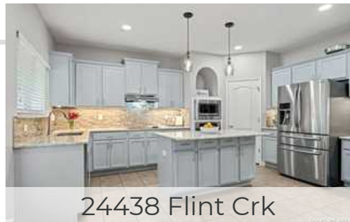
24438 Flint Crk

Square Feet: 2,589 Bedrooms: 3 Baths: 2 1/2 Garage: 2 Car, attached Days on the Market: 24 Days