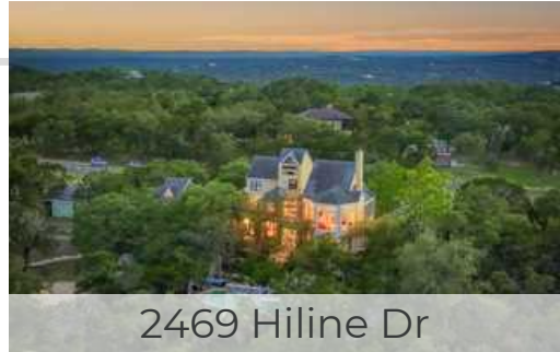
2469 Hiline Dr

Square Feet: 6,641 Bedrooms: 5 Baths: 4 1/2 Garage: Drive-way Days on the Market: 325 Days