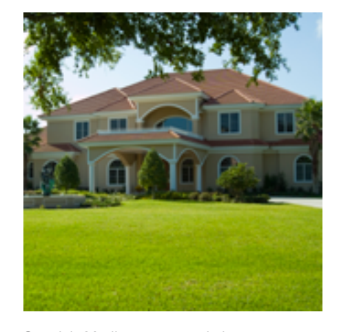
Spanish-Mediterranean style homes are commonly seen with clay roof tiles, arcaded porches, and arched corridors. They often include tiled floors and courtyards. Floor plans may resemble an L or U-shape.