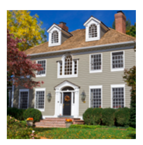
Colonial-style homes are usually two or three stories. The bedrooms are placed upstairs, away from the living areas. They feature simple designs and are characterized by evenly spaced elements.