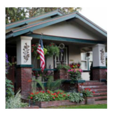
Craftsman style homes are known for their emphasis on natural materials: wood, stone, and brick. These homes are coupled with front porches and low-pitched roofs. Floor plans may vary.