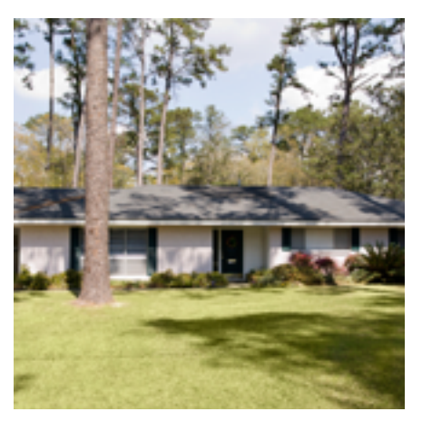
Ranch style homes focus on their connection to the outdoors. They typically have open floor plans and are single-story houses. Most will feature large, picture windows.